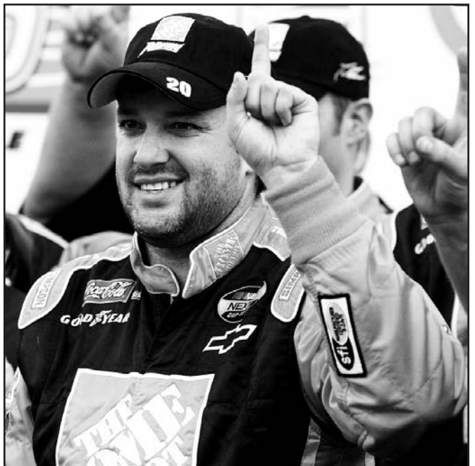
Tony Stewart at Martinsville Speedway in 2006.

Midget title in 1994 and finishing 10th and sixth in the Sprint and Silver Crown divisions, respectively, Stewart went out and set a new standard of excellence in 1995 by winning all three divisions. No driver had ever won the Sprint, Midget and Silver Crown championships - divisions that run three very different types of race cars which compete on both asphalt and dirt - in a single season until Stewart came along. He won the International Race of Champions (IROC) during that series' final year of operation in 2006, and it's clear that Stewart is in a league of his own. He is the first and only driver to have won championships in stock cars, Indy cars and open-wheel Midget, Sprint and Silver Crown cars. And his three NASCAR Sprint Cup Series championships made him one of just nine drivers who have scored three or more Cup titles. "My dad never pressured me to be the best race car driver in the world, but he did pressure me to be the best race car driver that I could be," Stewart said. "He never compared me to anybody else. He expected that what I could do was what I could do. He never said that because this guy over here could do something that I should be able to do it, too. He pushed me hard, but he was fair about it. That's probably